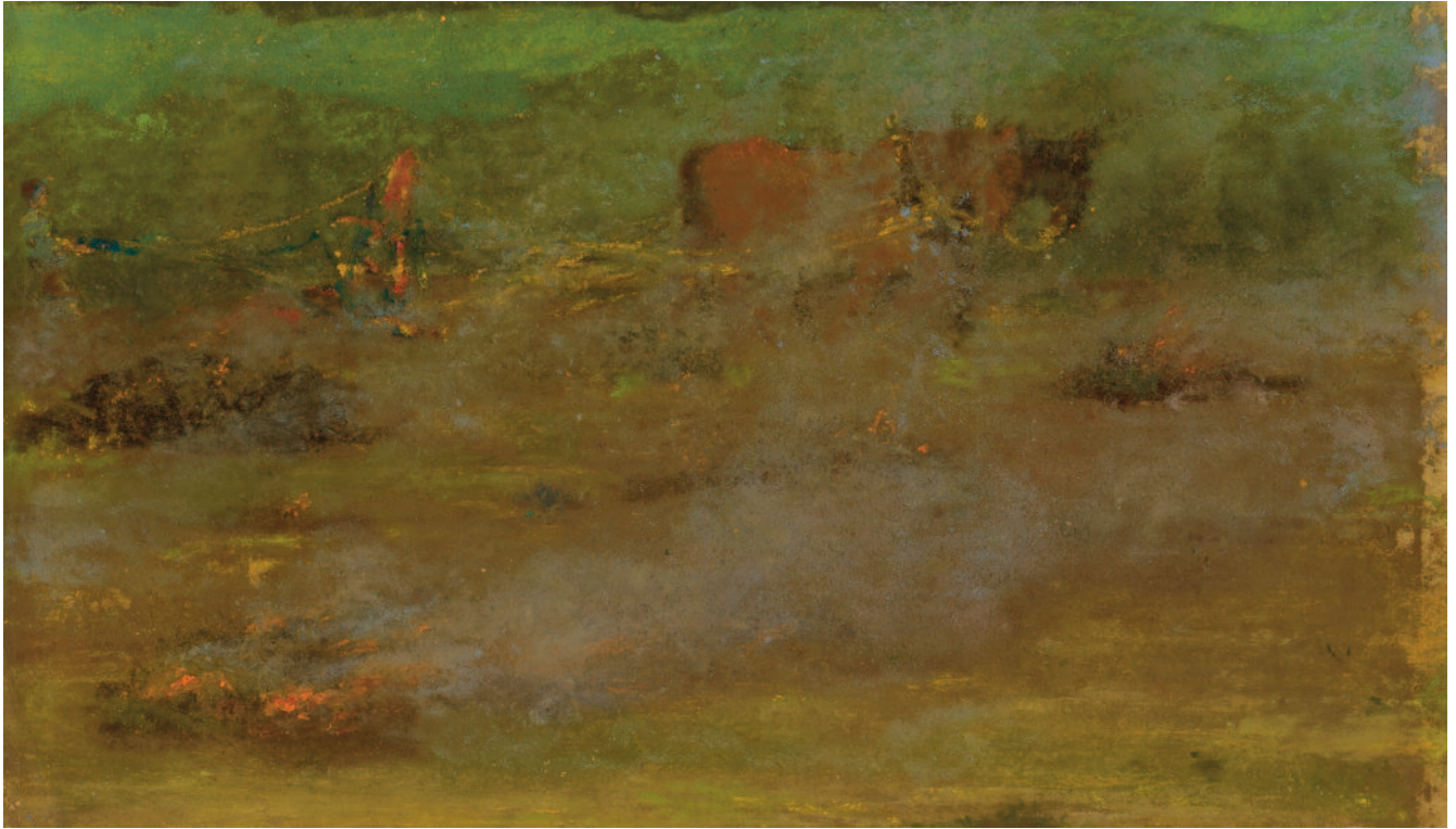
14. Horse and plough by bonfires (15 by 25 cm)