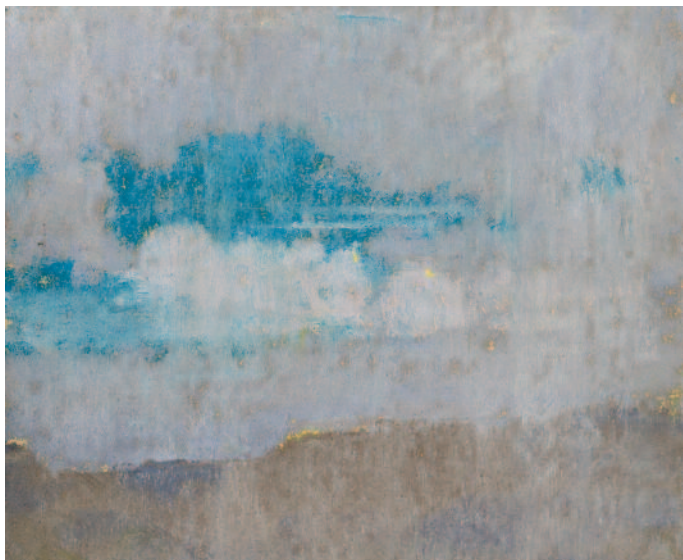
22. Blue skies emerging after rain (13 by 15 cm)