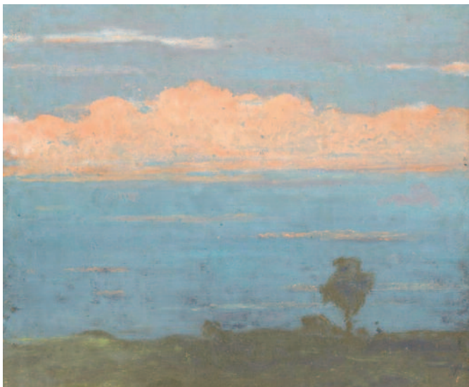
18. Cloud study in pink and blue (13 by 15 cm)