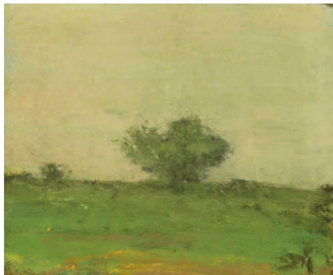
19. Tree on the brow of a hill (13 by 15 cm)