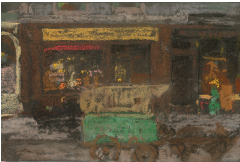
8. Cart and horse by a shop front (15 by 23 cm)