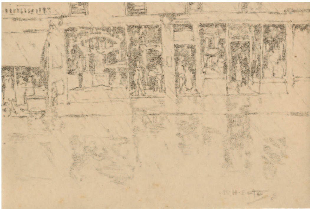
17. Rain on a busy high street , signed l.r., pencil (15 by 25 cm)