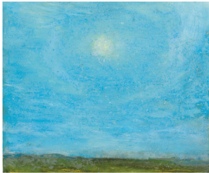
13. Sun through a thin mist (13 by 15 cm)