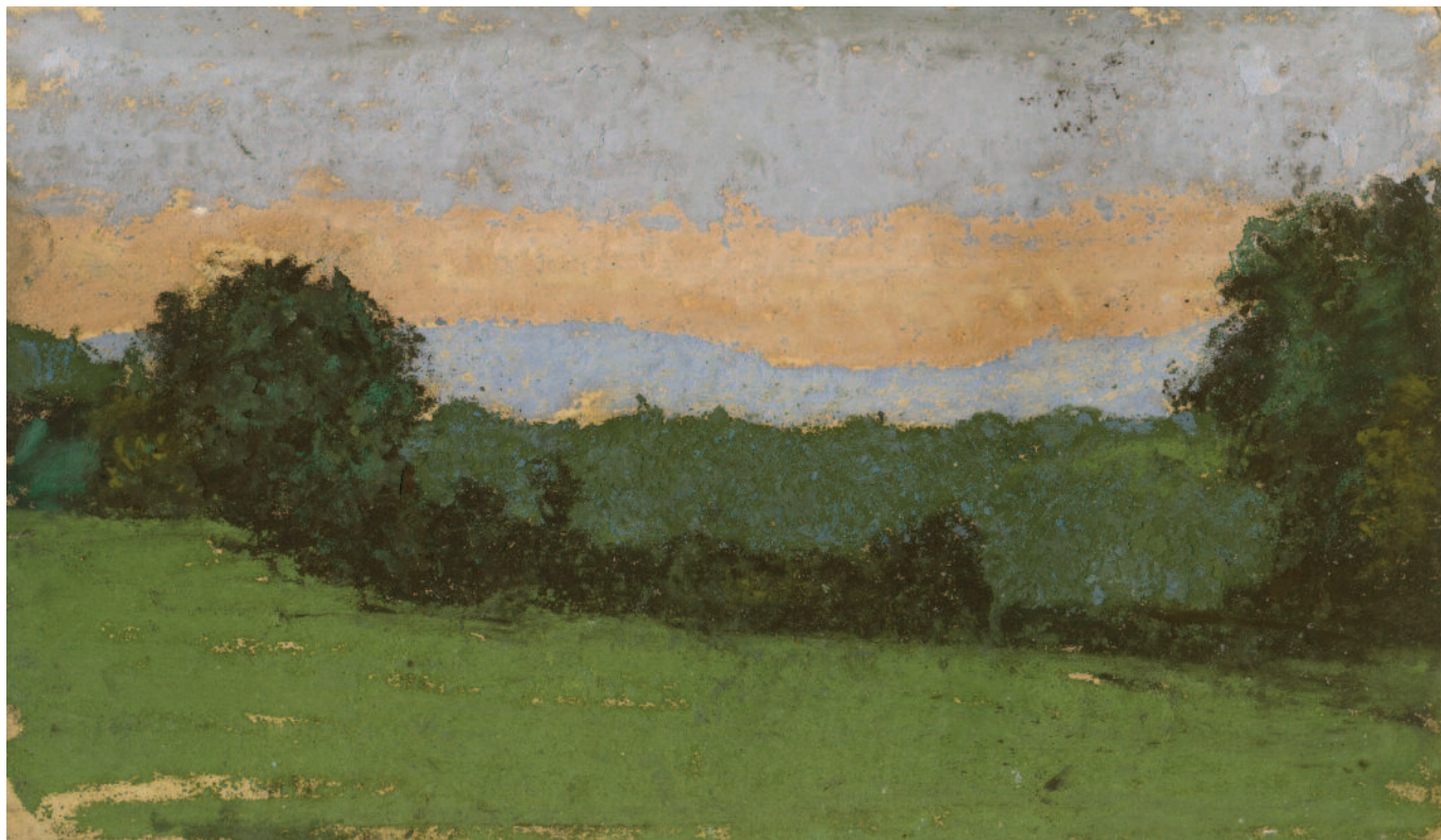
21. Wooded landscape at sunset (15 by 25 cm)