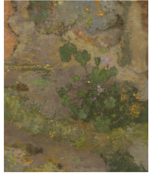
16. Wild flowers (15 by 12.5 cm)