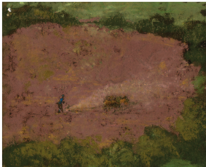
28. Man and plough on a hillside (13 by 15 cm)