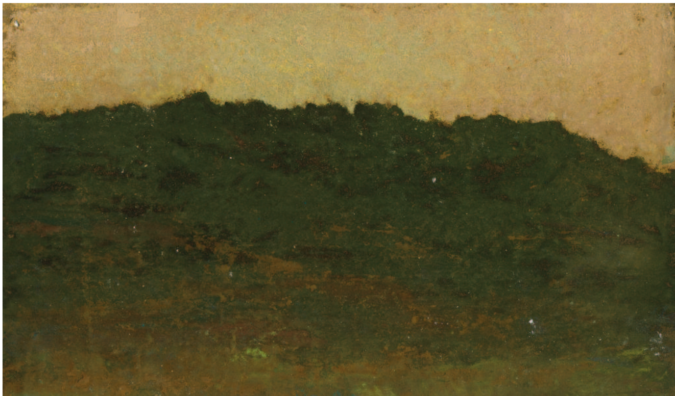
5. Dark hills, dusk (15 by 25 cm)