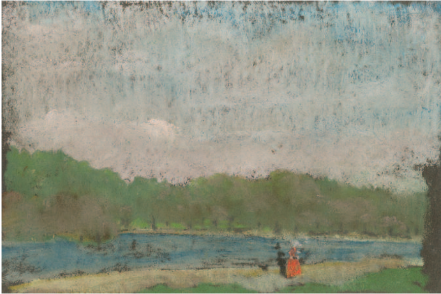
15. Figures walking by the Serpentine (15 by 23 cm)