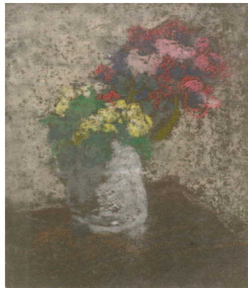
7. Still life (17 by 15 cm)