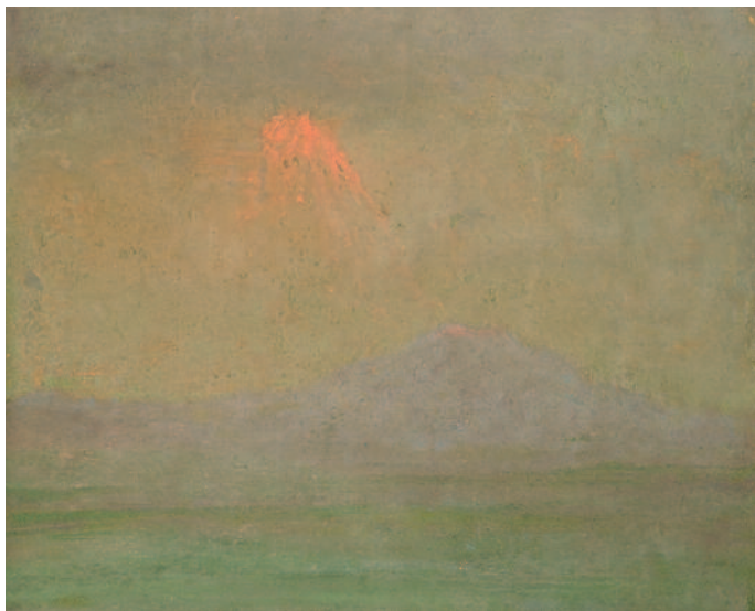
12. Sun emerging through fog (13 by 15 cm)