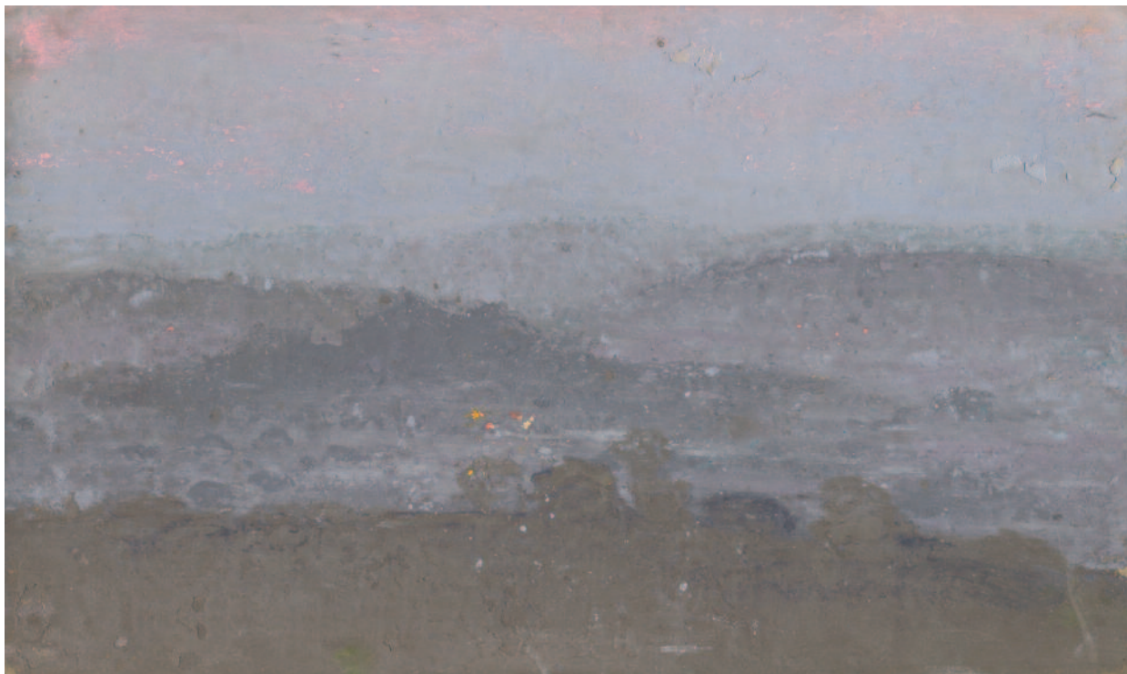
20. Nightfall near Dartmoor (15 by 25 cm)