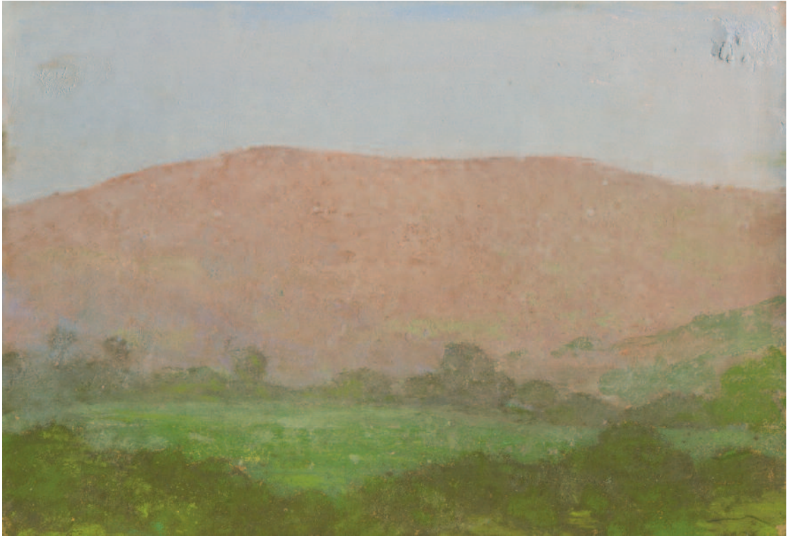
24. Pink Dartmoor (15 by 25 cm)