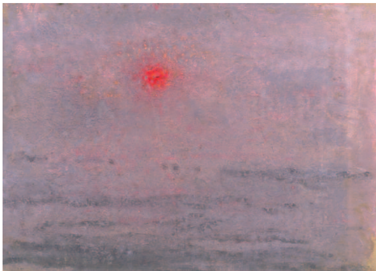
10. Pink sunset over sea (15 by 21 cm)