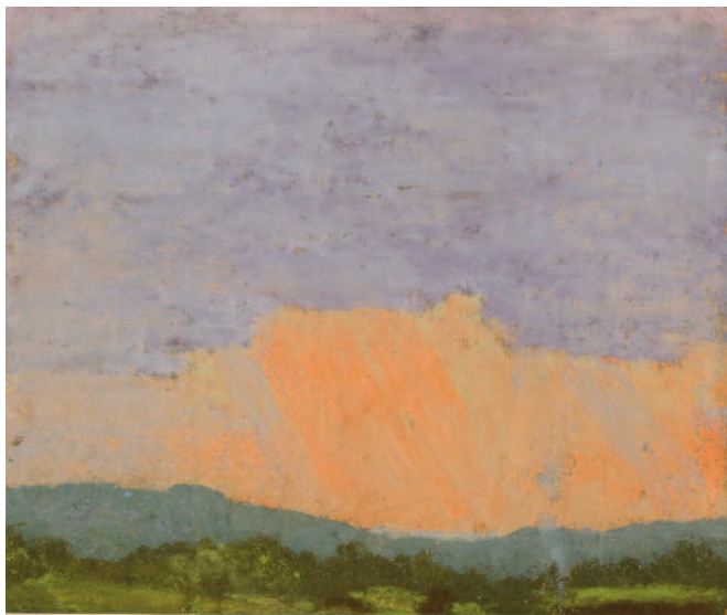
27. Sun rays emerging through cloud (13 by 15 cm)