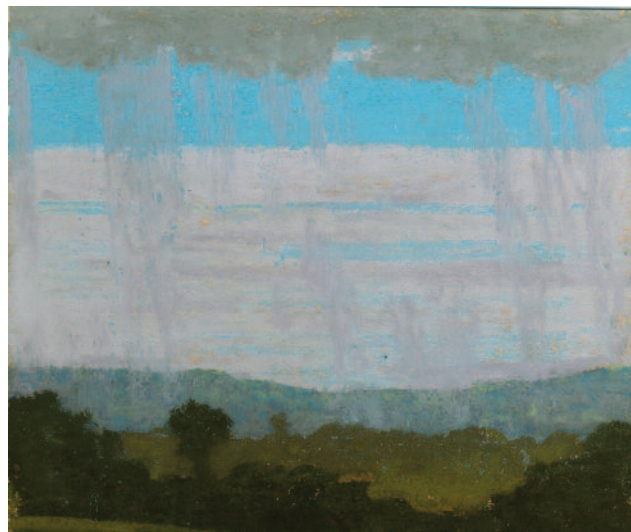
11. Passing spring showers (13 by 15 cm)