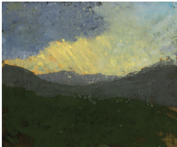
23. Passing shower illuminated by sunlight Dated on paper: May 24/16 (13 by 15 cm)