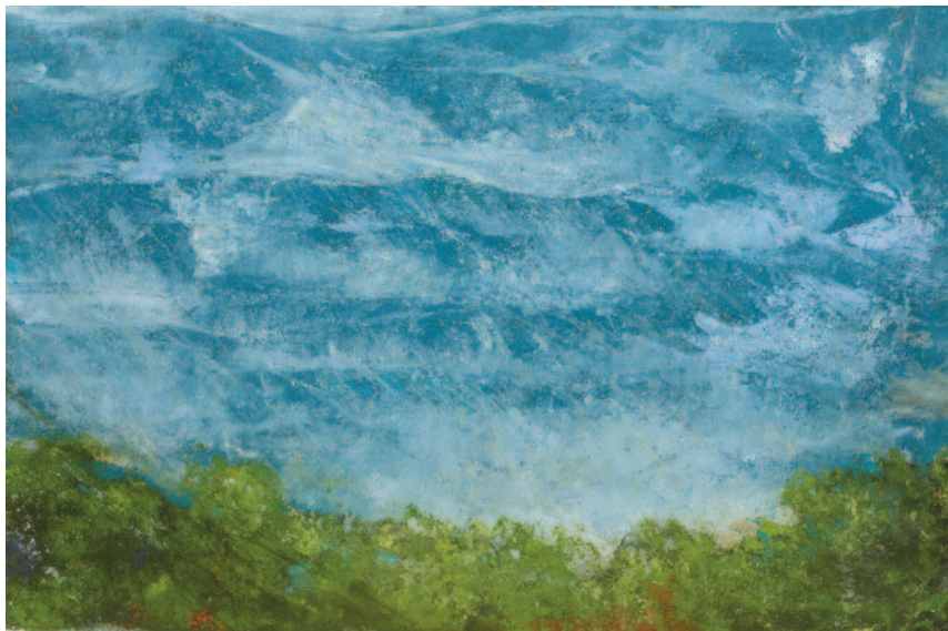
6. Windswept clouds Dated on paper: May 21/1916 (15 by 22.5 cm)