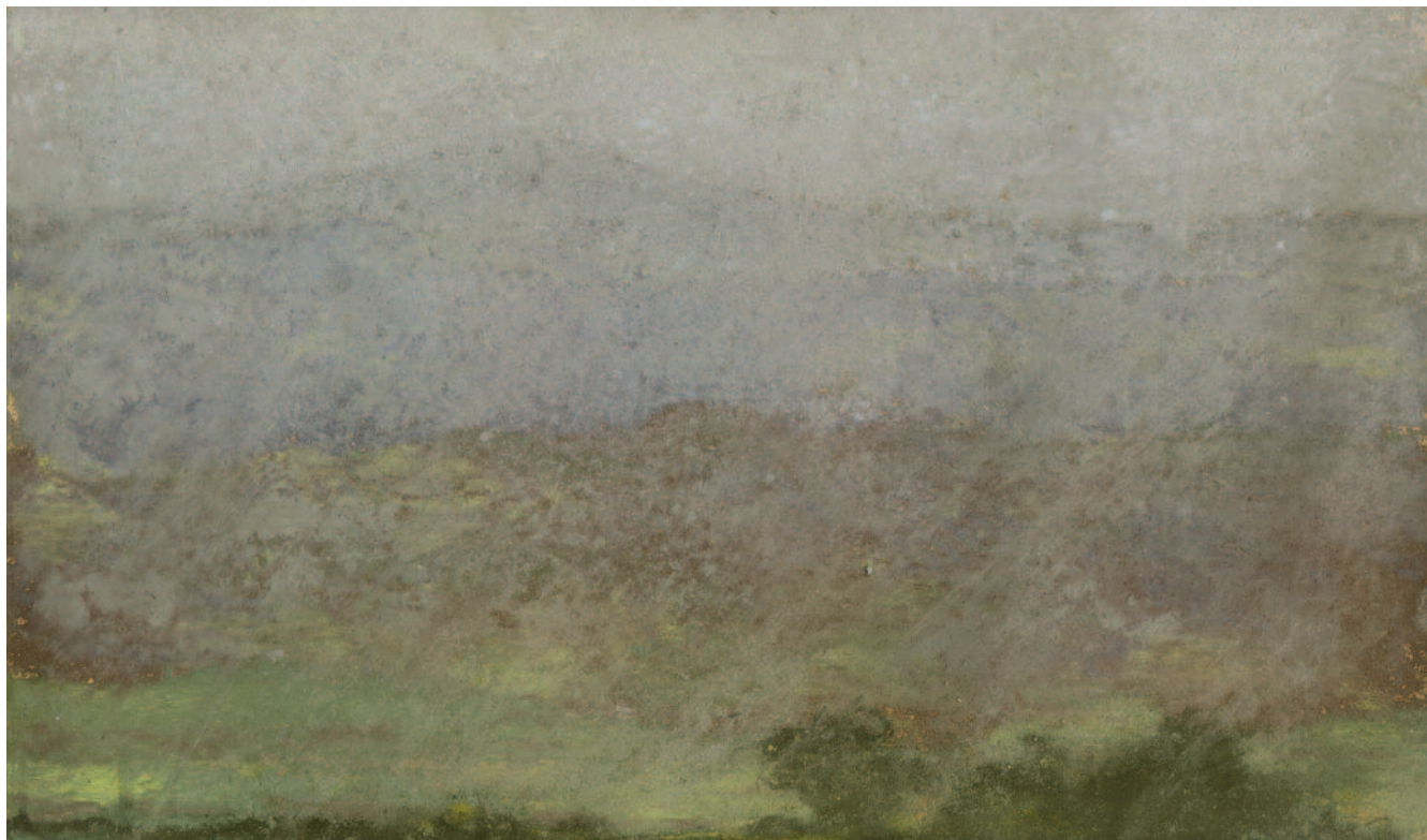
26. Stormy weather over Dartmoor (15 by 25 cm)