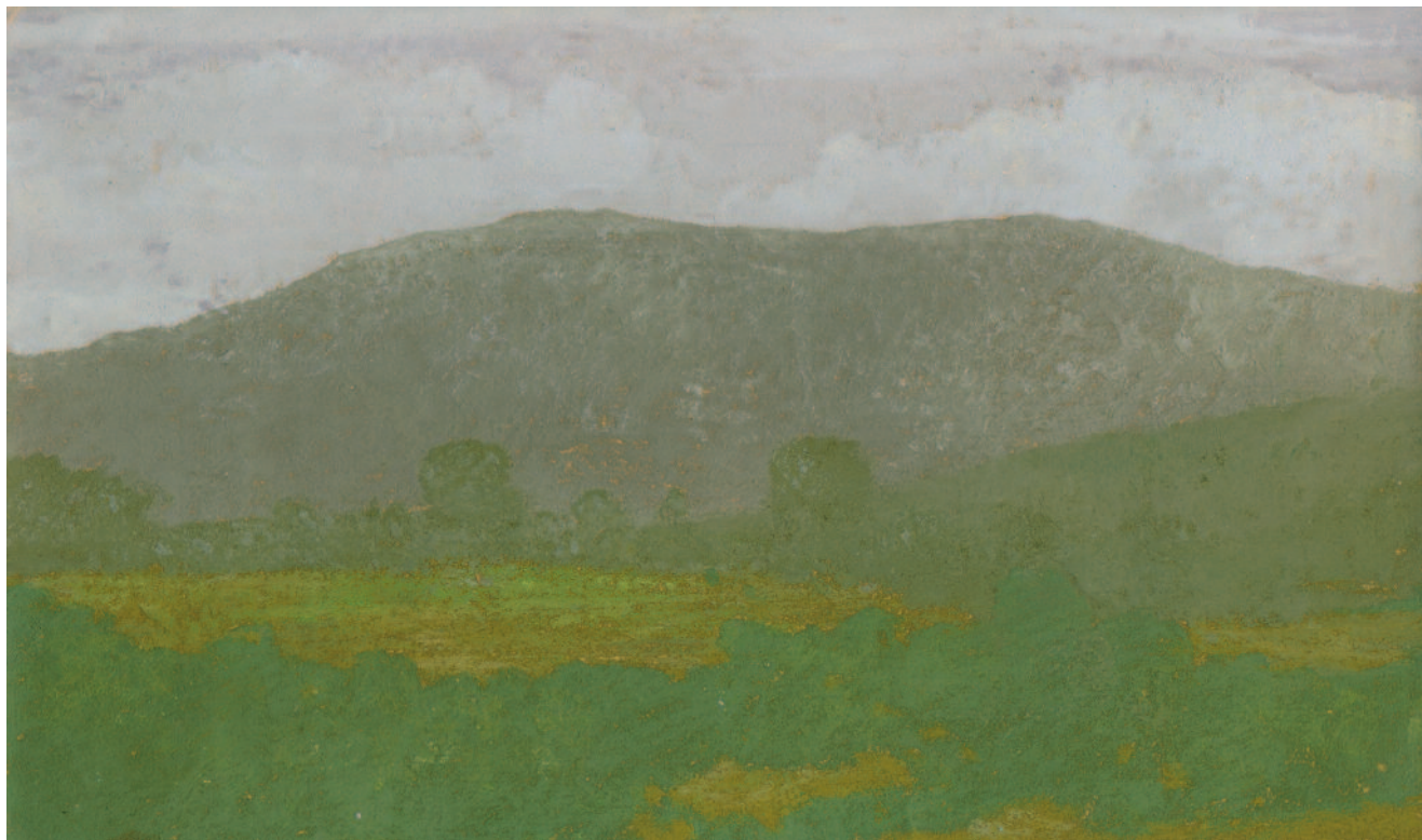
25. Green Dartmoor (15 by 25 cm)